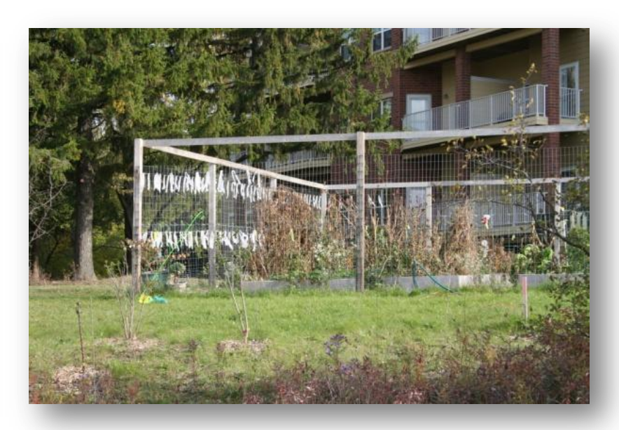
This sturdy 6-foot high fence provides great protection for this garden