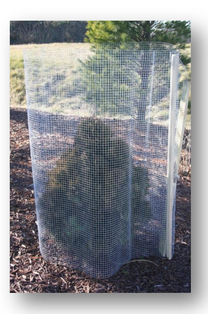
A ring of hardware cloth stapled to a stake driven into the ground can protect shrubs and small trees from rabbits and deer