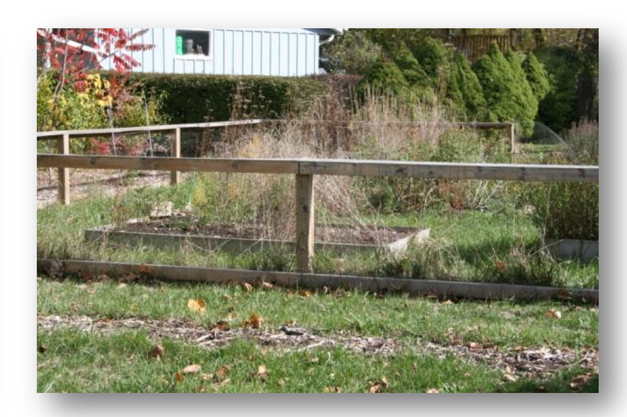
This garden is protected using chicken wire framed with 2''x4''s attached to 4''x4'' posts. The height is 4 feet, enough to keep cottontails out and to stop casual foraging by deer.