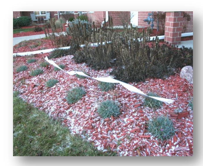
A ribbon of Irri-tape attached to 6"-8" -high stakes in or around the garden may help keep animals away.

We recommend that you consult with an experienced Master Gardener or horticulturalist in your area for information about treating your lawn for grubs.