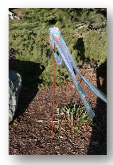
Irri-tape , cut into strips and stapled to stakes so they flutter in the breeze, can help deter animals.