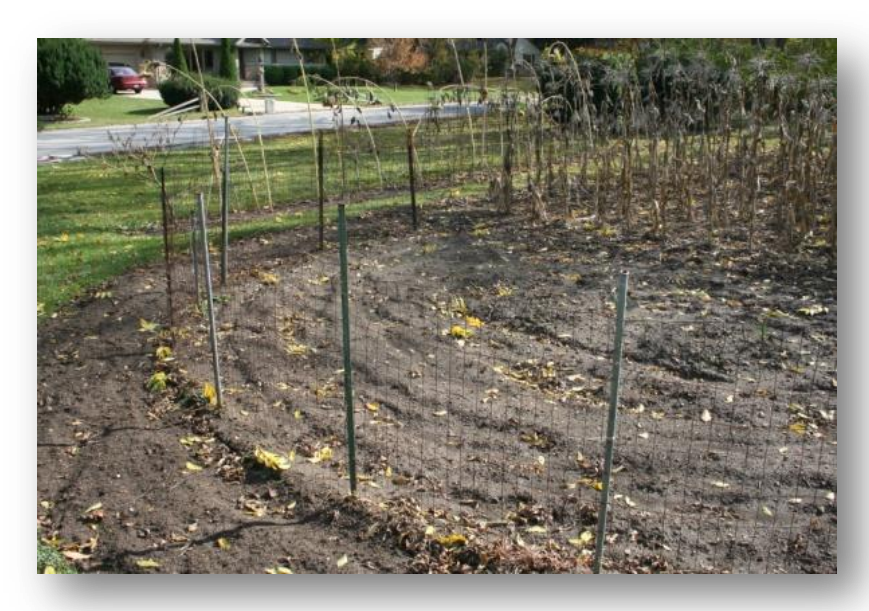
2"x4" wire screening attached to metal posts. This 3 foot tall fence will discourage casual foraging by deer. To keep rabbits out, use smaller-mesh fencing