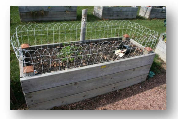
Raised garden beds like these will keep rabbits out. The bed below uses an arch of hardware cloth over the top to protect tender plants from deer